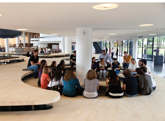
Views of the 31st Bienal de São Paulo – How to (...) things that don't exist (2014).